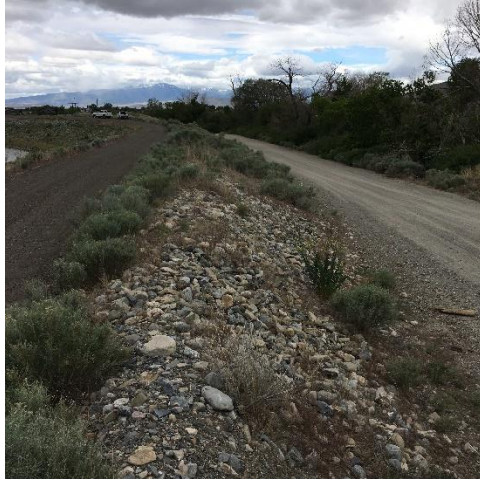
Figure 1. Woody vegetation along embankment.