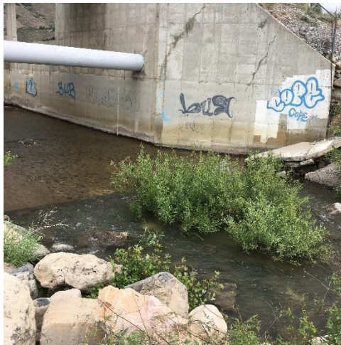
Figure 2. Large bush obstructing spillway channel.