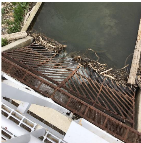
Figure 3. Debris accumulating on the spillway trash rack.